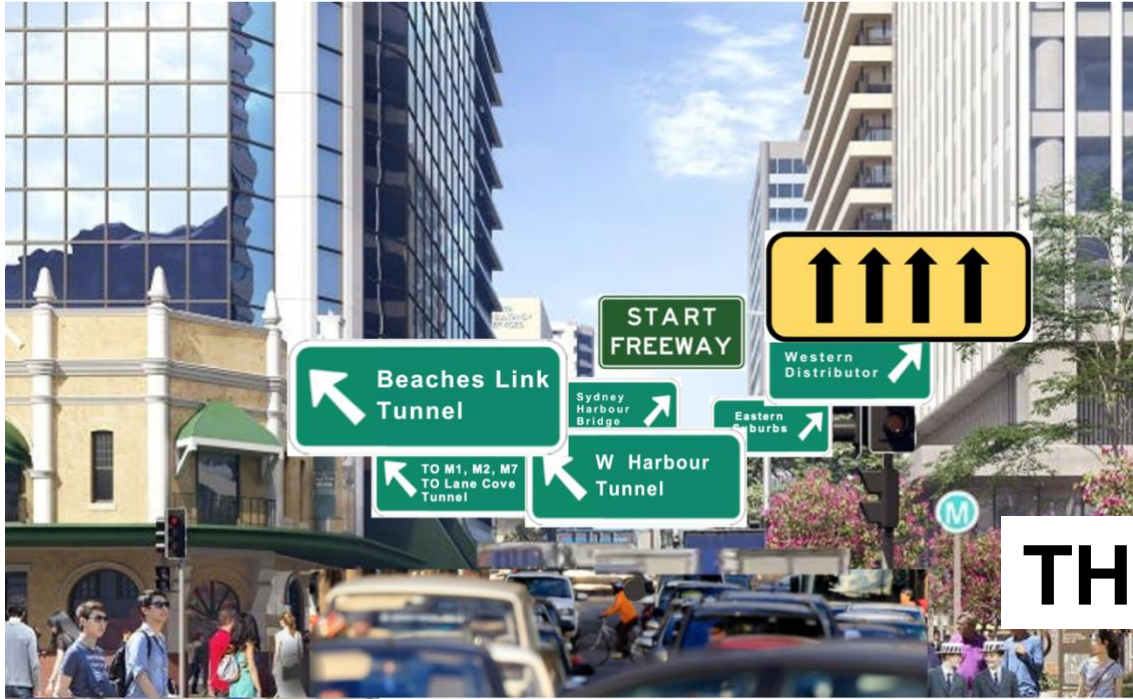
Over $20 billion to spend on tunnels and interchanges – and this is what the Premier does to Berry Street.