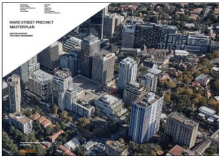
Ward Street master plan stage 2

In August the Council published the Ward Street precinct master plan stage 2 – the full report by Hassell and the Council's summary brochure. Submissions were received until 8 October 2018. The report remains on the Council's website. A more comprehensive work is the CBD public domain strategy . The report by Aspect Studios (and others) is also summarised in a Council brochure. The report is on exhibition until 8 February 2019.